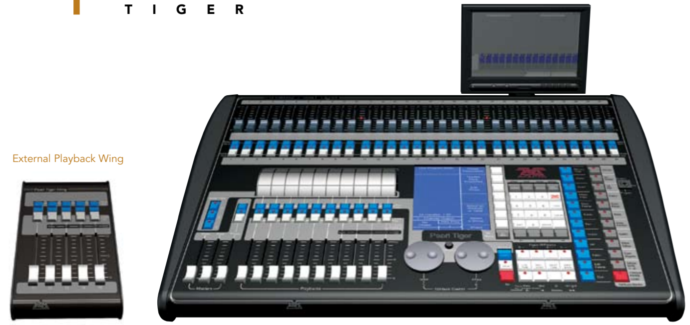
External Playback Wing